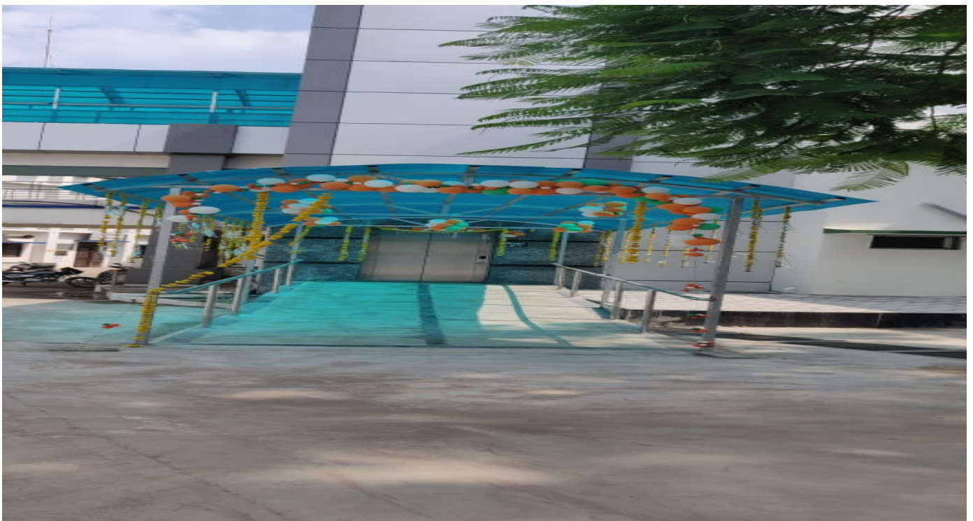
Lift at DRM office –RTM