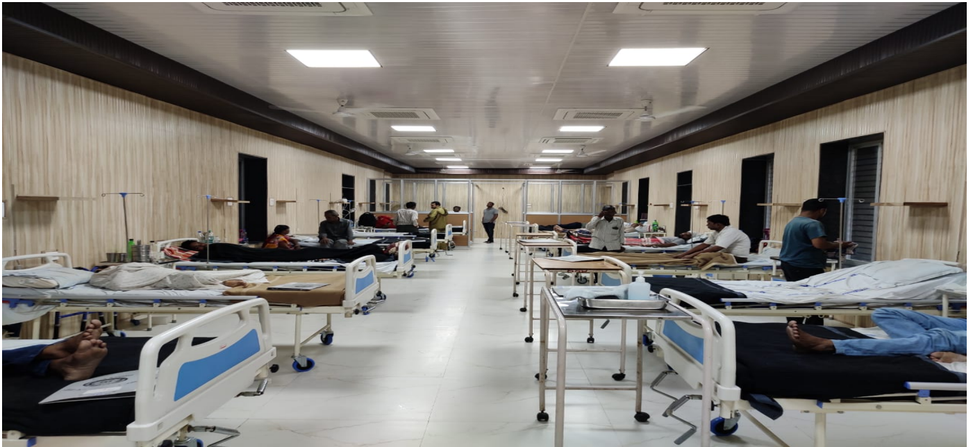
Air conditioning of Male ward in Divisional Hospital –RTM