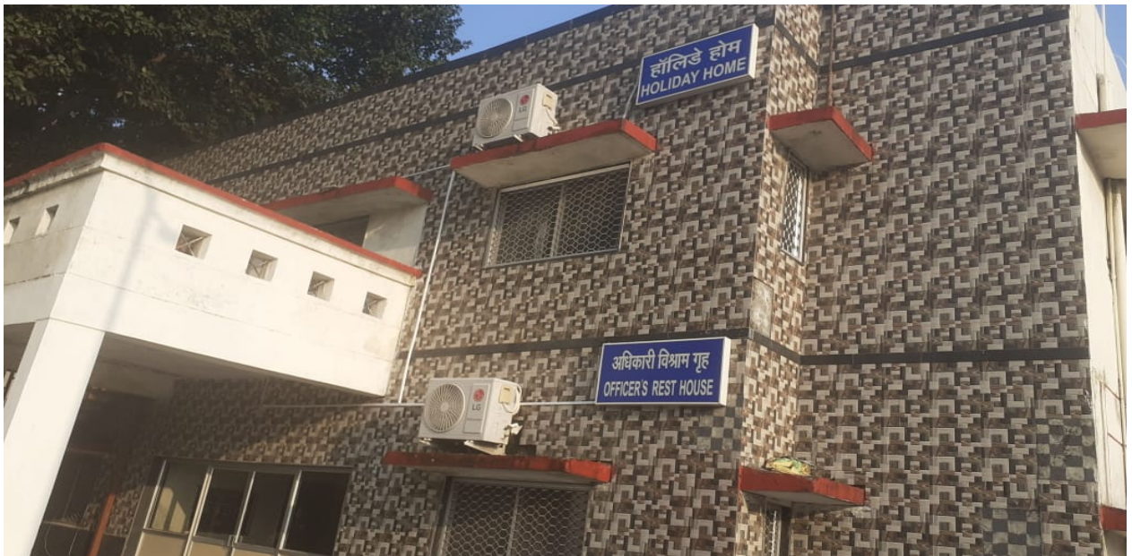
Air conditioning of Holiday Home – UJN