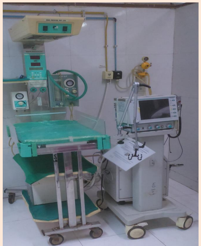
Ventilator and CPAP in NICU [Ward 9]